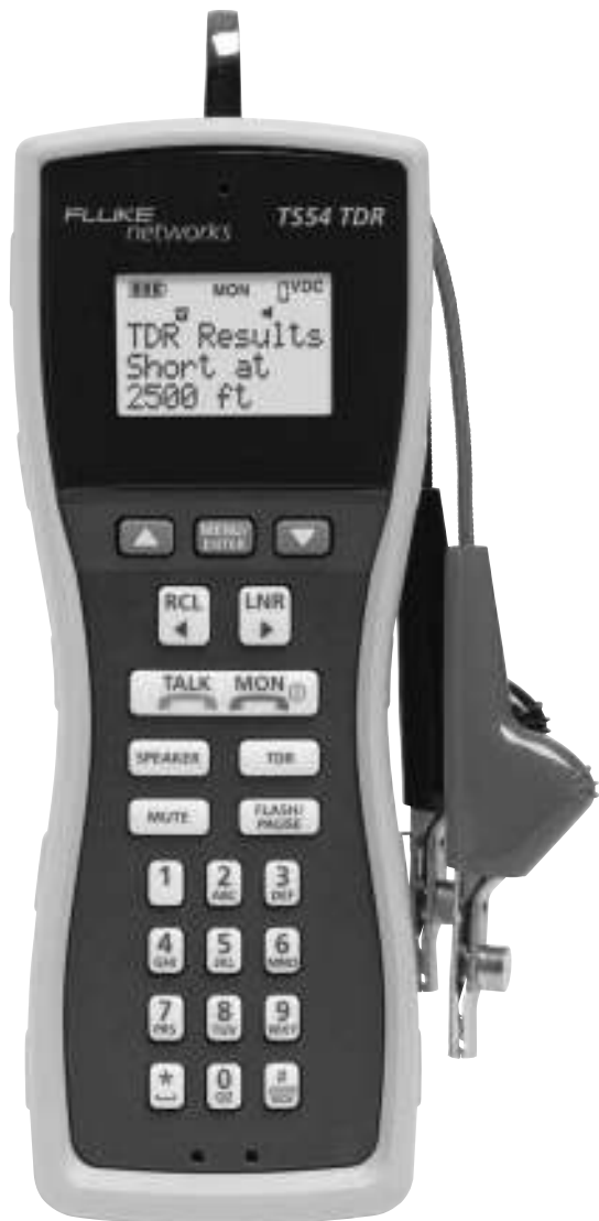
Extra-large, backlit LCD screen